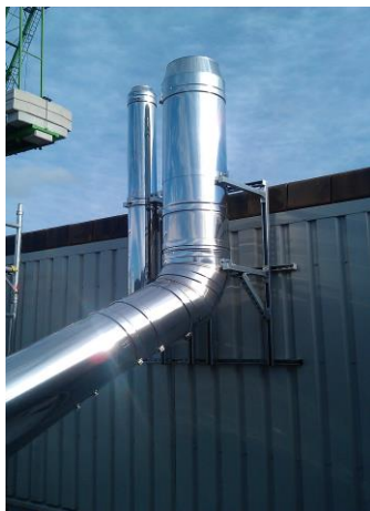
Installation of External Flues