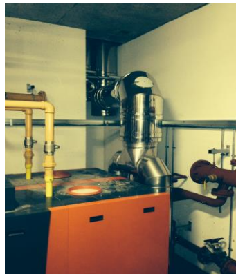
Boiler Room Flue