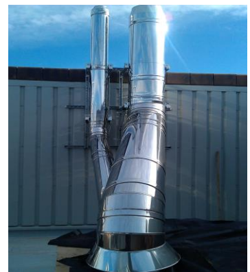
Rooftop flue terminations

New £20 Million Signature Care Home for Marlow is nearing completion. Signature Senior Lifestyle is finalising construction of a new care home located on Little Marlow Road in Marlow, Buckinghamshire. The Marlow care home comprises 57,000sq ft of floor space set over three storeys within extensively landscaped gardens.