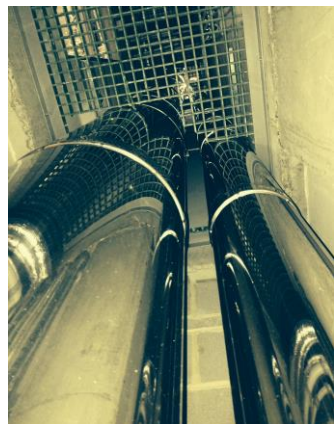
Flues within Riser