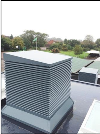
Natural Ventilation Terminals