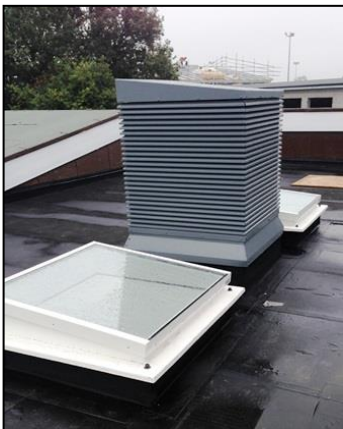
External view on flat roof