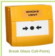
Break Glass Call-Point)