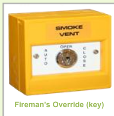
Fireman's Override (key)