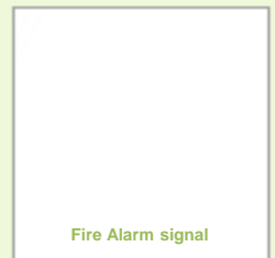
Fire Alarm signal